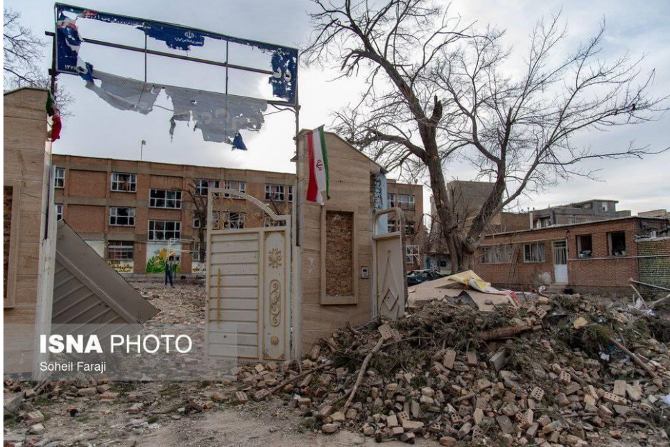
The Imam Reza boys' school in Abyek, Qazvin, was seriously damaged. An innocent schoolboy was killed and 3 of his schoolmates were injured.