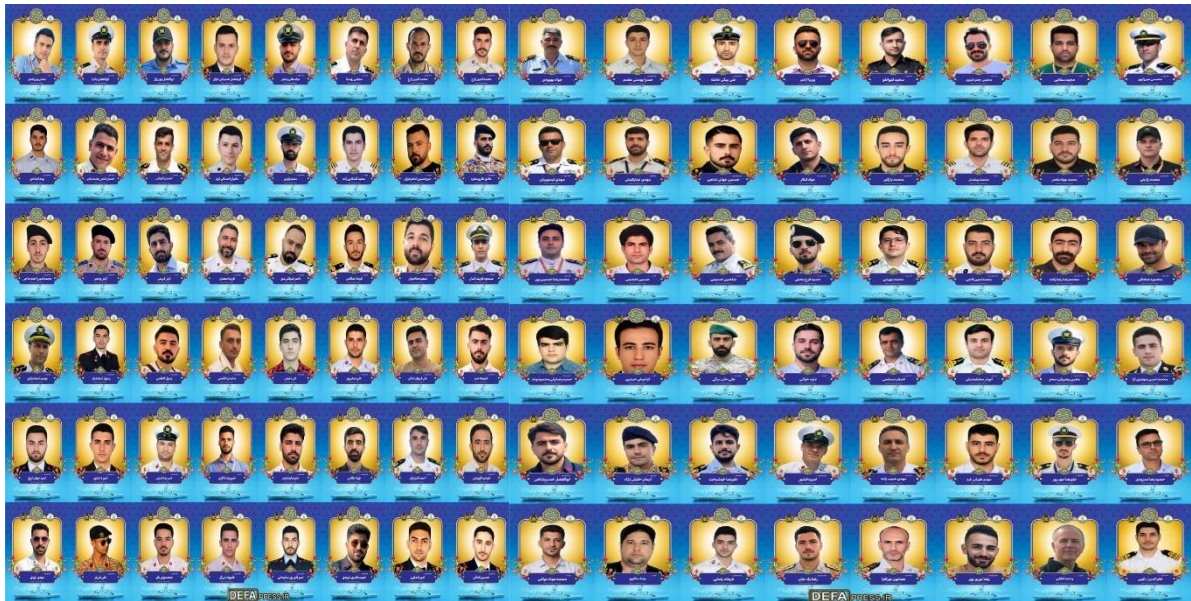
Directing deliberate attacks by the US armed forces against an Iranian frigate “Dena” far from the battlefield claimed the lives of at least 87 crew members.

162. In this attack, which was carried out with a torpedo, from the total of 140 crew members on board, at least 87 crew members were martyred and 32 more injured. The injured were then rescued by the Sri Lankan Navy. 20 are still missing though.