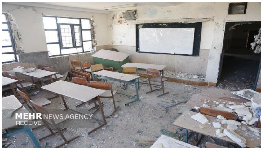
Aftermath of a classroom damaged by US and Israeli regime's missiles. These cowardly attacks instill terror among innocent students.