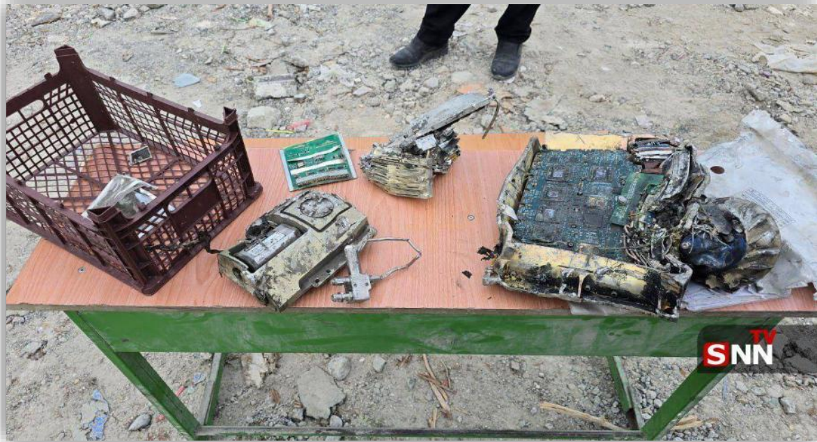
The remnants of an American missile used to bomb the primary school.

severity of the damage caused by the attack was such that debris removal operations continued until the next day.