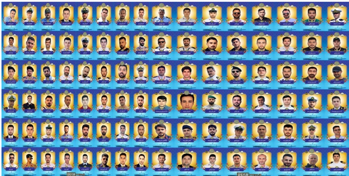
Directing deliberate attacks by the US armed forces against an Iranian frigate “Dena” far from the battlefield claimed the lives of at least 87 crew members.

162. In this attack, which was carried out with a torpedo, from the total of 140 crew members on board, at least 87 crew members were martyred and 32 more injured. The injured were then rescued by the Sri Lankan Navy. 20 are still missing though.