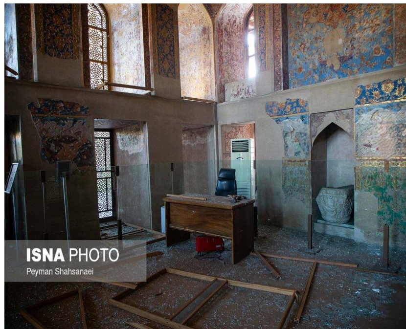
During the unlawful attacks of the armed forces of the US and the Israeli regime against Masjid Shah in Isfahan, the invaluable decoration of the walls sustained significant damage.