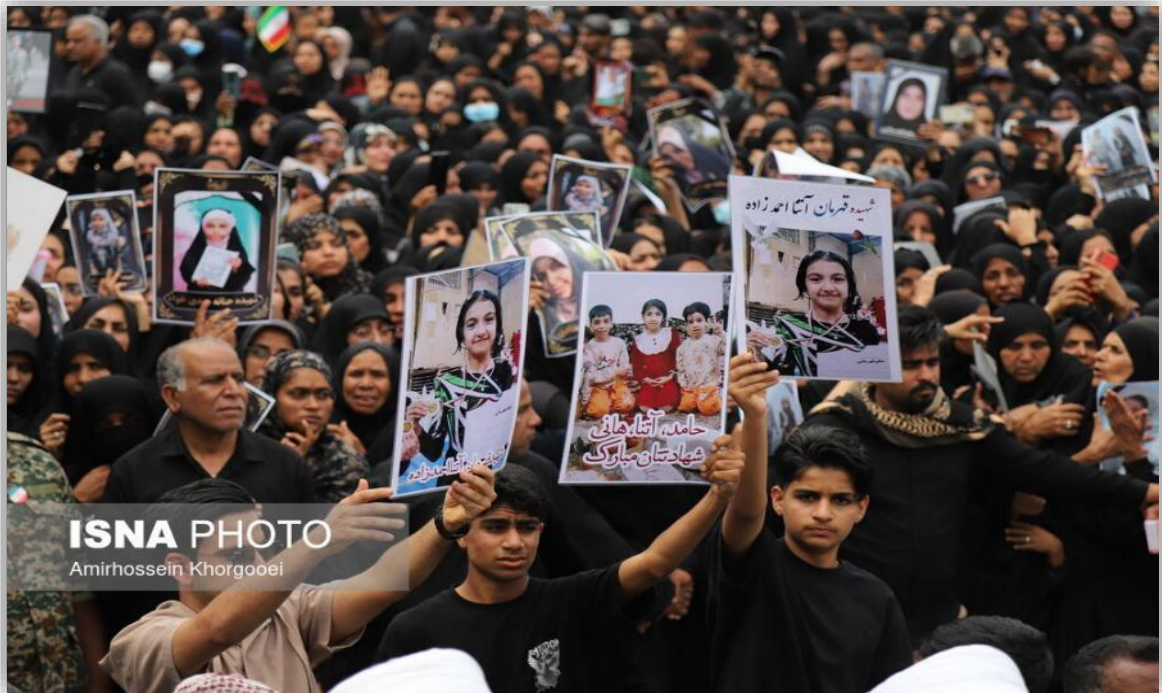
Demonstrators holding the pictures of schoolgirls martyred by American bombs on the Shajar-e-Tayebe primary school in Minab, Hormozgan.

about it being a war crime, as also proved by several official media in the following days.