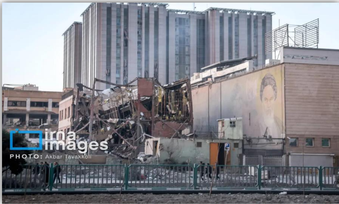
The aftermath of direct attacks against civilian objects in Shahid Fakouri neighborhood, Tehran.