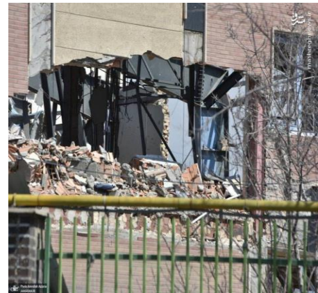
The 12000-seat Azadi Stadium, an icon of the collective memory of generations of athletes, ruined by 7 missiles in the deliberate attacks of the US and Israeli regime.