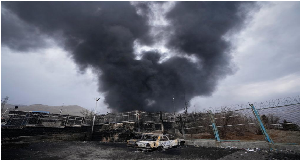
Unlawful targeting of oil reservoirs in Fardis, Alborz province, led to significant damage to the natural environment endangering human health and the integrity of the ecosystem.