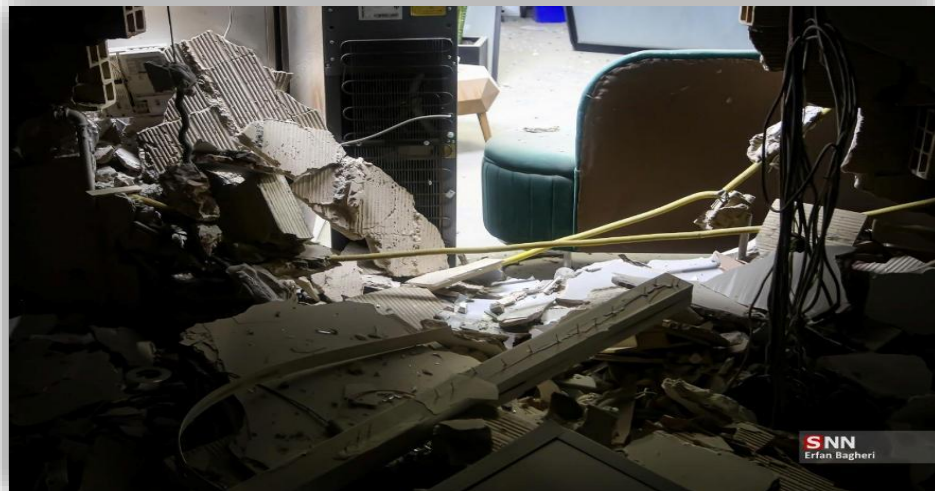
The Gandhi Hospital in Tehran sustained severe damage after the US-Israeli attacks on 1 March 2026.