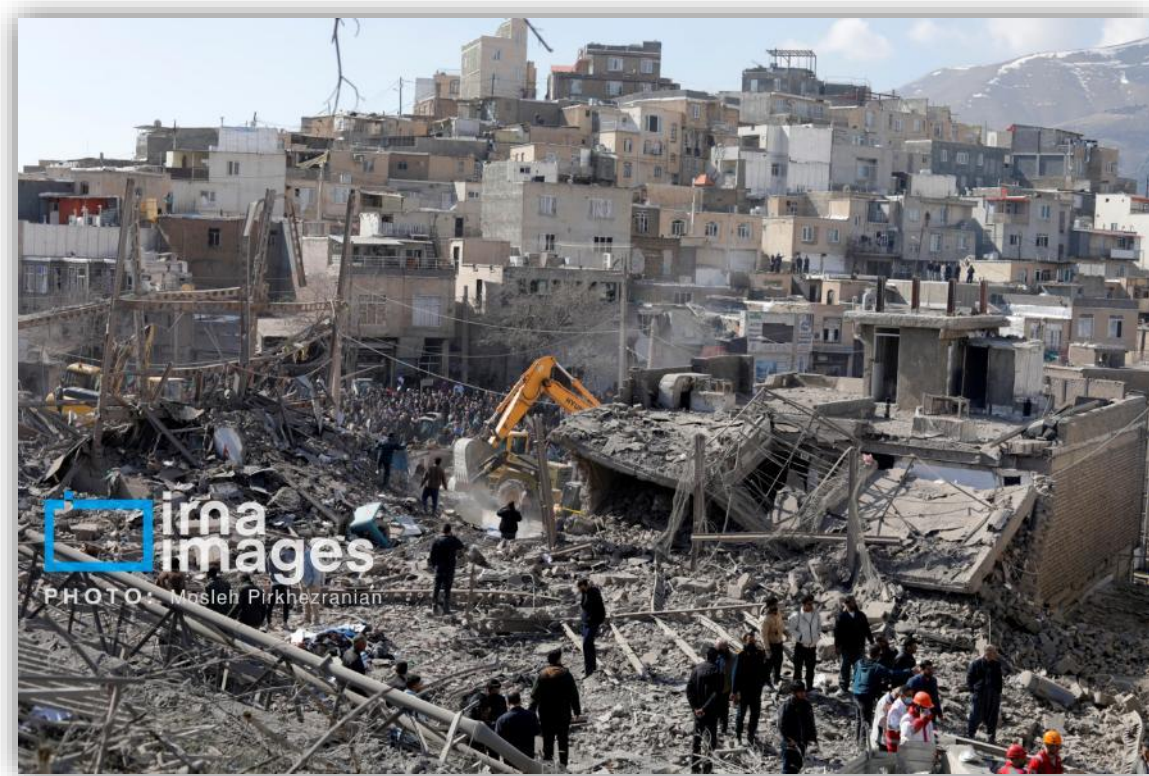
The aftermath of attacks on a densely populated area in Sanandaj, Kordestan province.