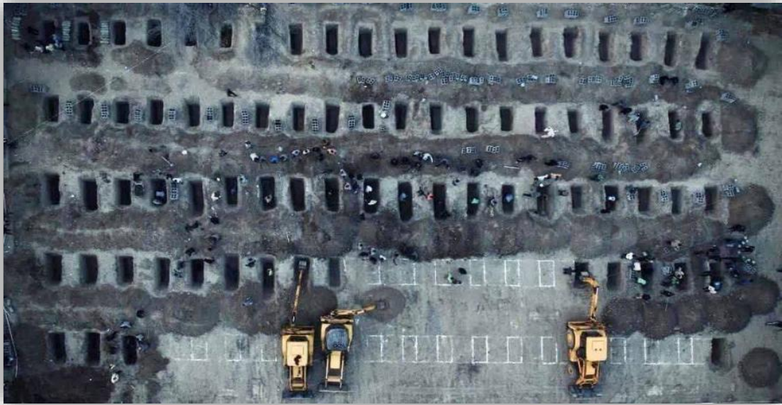
Mournful gloomy aerial snapshot of the tombs to embrace the bodies of innocent schoolgirls killed by the direct attacks of American fighter jets.