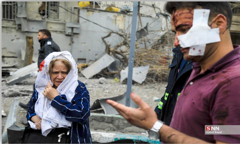
With rubbles in the background, a lady injured in the US-Zionist aggression in Tehran.