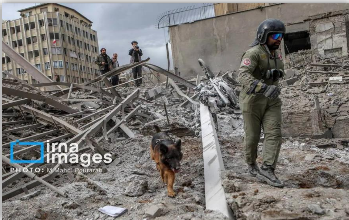
Wanton attacks by the US-Zionist aggressors against a diplomatic police centre in Tehran in pure defiance of IHL: targeting a civilian object with civilians present inside!