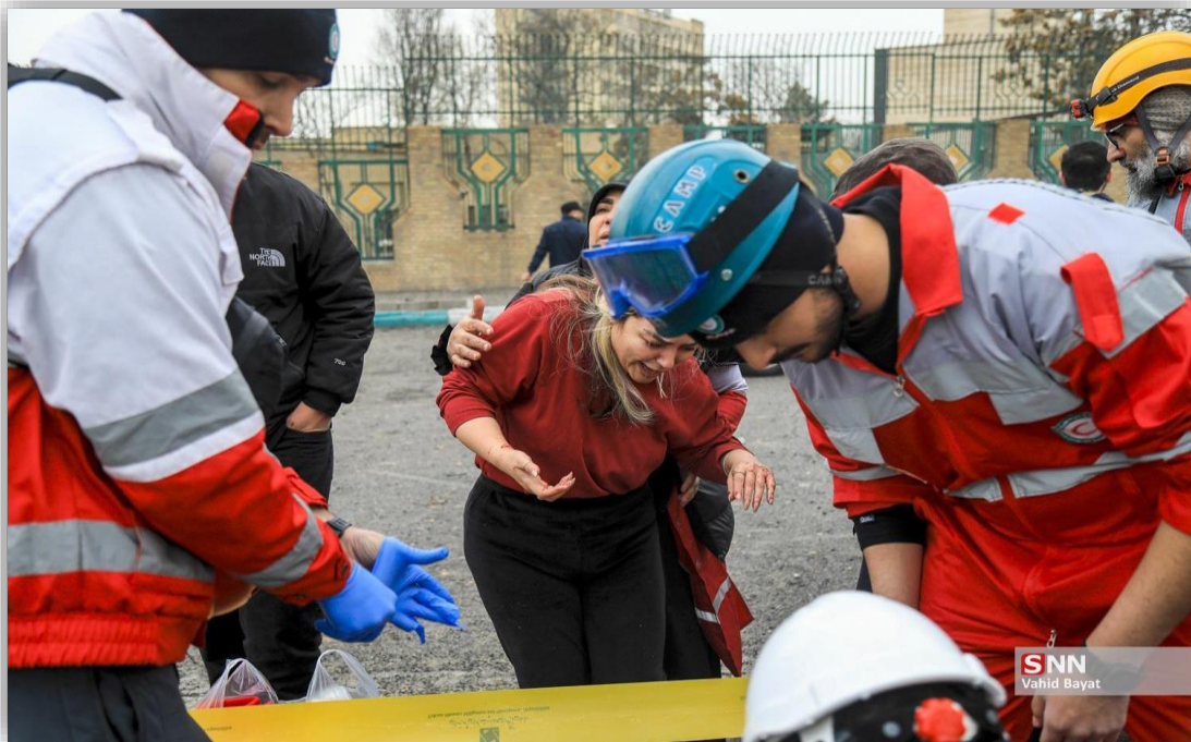
A lady injured by the indiscriminate attacks of the aggressors in Tehran being helped by the Red Crescent.