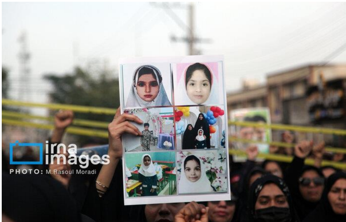
A demonstrator holding the pictures of a few martyred students of Shajare-e-Tayebeh primary school in Minab, Hormozgan province; from among over 170 innocent children brutally targeted by the aggressors at 11:15 during school time!