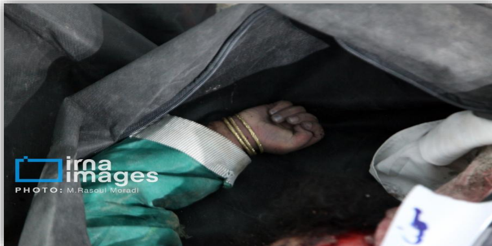
The partial photoshoot of the body of one of the schoolgirls fallen victim to an American war

49. This school was located far from any military zone, with zero links with any military site, camp or whatsoever that could possibly raise any presumptions about the attacks being carried out without ill intent. Therefore, no doubt remains